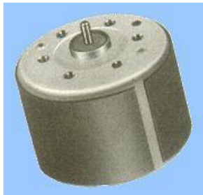
Weight: 28g (Approx.)

Remarks: RF 310 and RF 320 are of the same size as above. Only the total length of RF320 is 29.6mm as a reference.