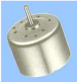
Weight: 29g (Approx.)